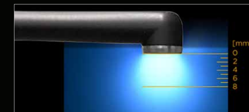
SmartLite ® Pro: Collimated beam for reliable curing over larger distances.